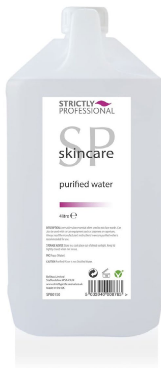
SPB0150 – 4L

Orange Flower Water: a light skin toner suitable for dry and delicate skins. Orange flower water restores moisture, boosts circulation and helps to shrink open pores. A popular choice for face masks.