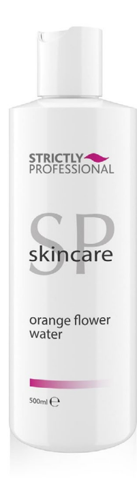
SPB0329 – 150ml SPB0330 – 500ml

Orange Flower Water: a light skin toner suitable for dry and delicate skins. Orange flower water restores moisture, boosts circulation and helps to shrink open pores. A popular choice for face masks.