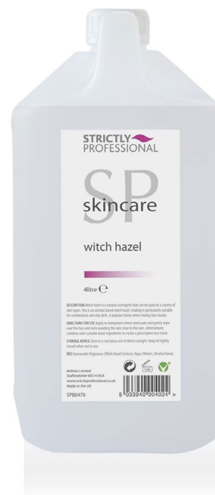
SPB0457 – 150ml SPB0460 – 500ml SPB0465 – 1L SPB0470 – 4L

Rose Water: a gentle skin toner suitable for all skin types especially normal, dry and sensitive. Rose water is a soothing, rich source of anti-oxidants.