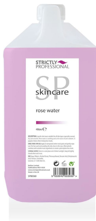
SPB0351 – 150ml SPB0350 – 500ml SPB0355 – 1L SPB0360 – 4L

Purified Water: a versatile salon essential. Purified water can be used in vaporisers/steamers or when mixing face masks. For specialist machines using water please read the manufacturers instructions carefully.