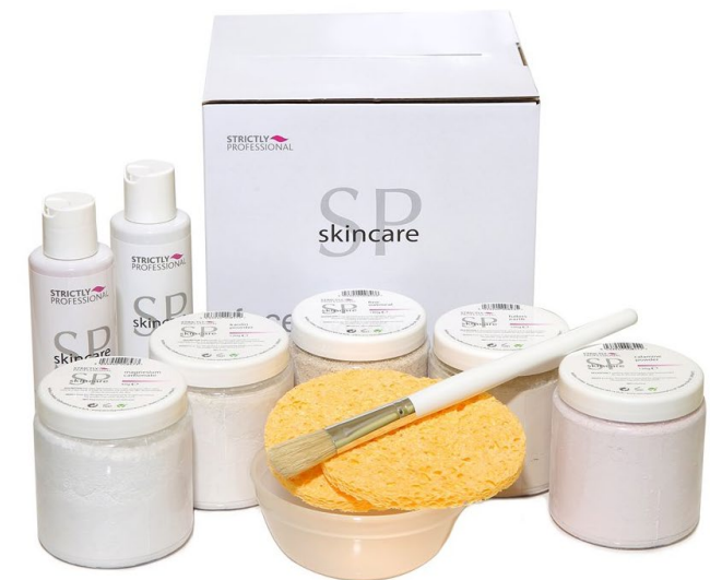
SPB0550 – Face Mask Starter Kit

Witch Hazel: a natural astringent than can be used on a variety of skin types. An alcohol-based witch hazel making it particularly suitable for combination and oily skins.