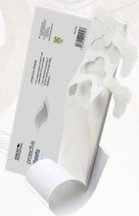
SPE7550 – Pack of 96

Our vegan-friendly Lash and Brow tinting products have gained a reputation over many years with beauty professionals for providing superior results: fuller, bolder brows and lashes defining every hair and emphasising shape and contour.