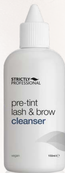
SPE7560 – 150ml

pre-shaped papers which fit well underneath the lower lashes. They help prevent staining of the skin during eyelash tinting treatments.