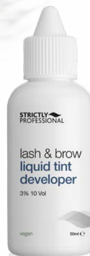
SPE7580 – 50ml

Developer: 3% 10 Vol peroxide cream formulation designed to combine with our Strictly Professional tints for a consistency that is easy to use offering long lasting results.