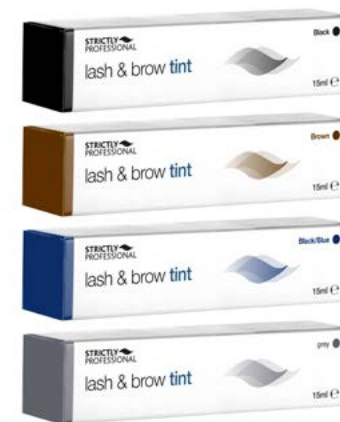
SPE7500 – Black 15ml

Remover: designed to remove unwanted tint stains or splashes from the skin. A handy dropper nozzle makes this easy, hygienic and economical to use.