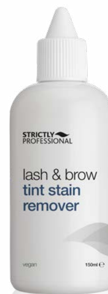
SPE7570 – 150ml

Developer: a 3% 10 Vol peroxide tint developer to be used in conjunction with Strictly Professional Eyelash Tints. A handy dropper nozzle makes this easy, hygienic and economical to use.