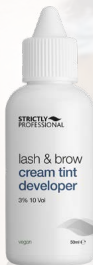
SPE7585 – 50ml

Cleanser: formulated to clean and prepare natural lashes and brows prior to tinting. A handy dropper nozzle makes this easy and hygienic to use.